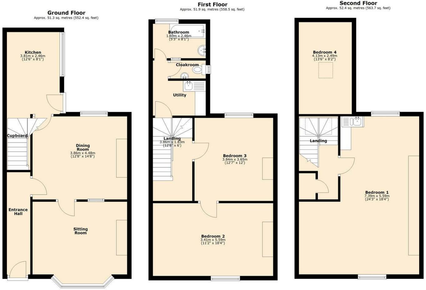
Total area: approx. 155.6 sq. metres (1674.5 sq. feet) 4 South View, High Bentham